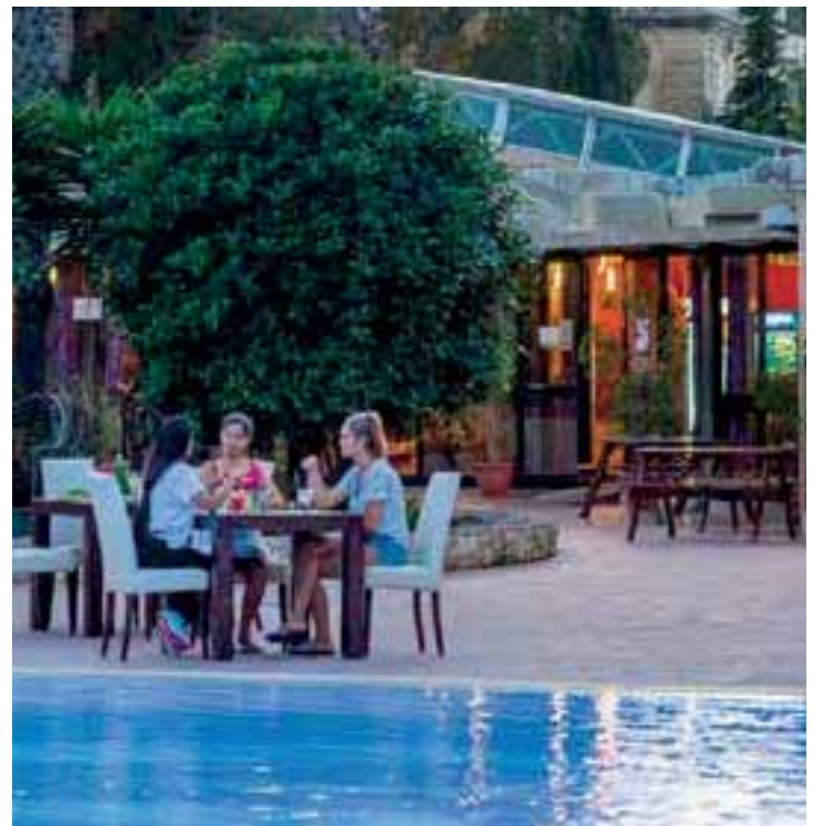
The picturesque town of St. Julian's, near which our English language school is located, is on the east coast of the island. Once a fishing village, today it is a bustling town full of restaurants, pubs and entertainment venues.